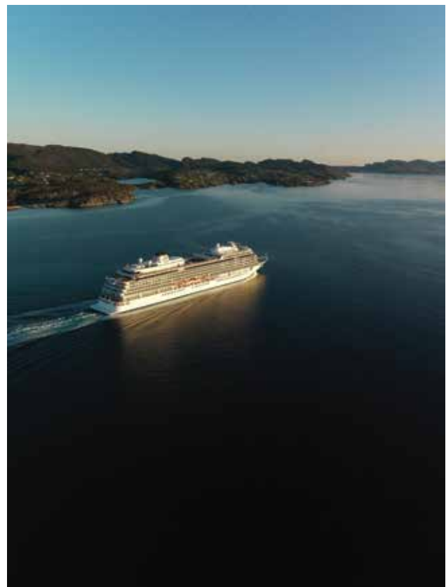
Viking has been a dedicated supporter of Vesterheim over the years and a partner in sharing Norwegian culture with the world.