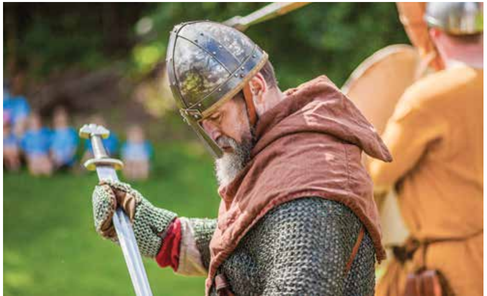
Vesterheim welcomed the re-enactment group "Skjaldborg," from Elk Horn, Iowa. They entertained with full combat demonstrations in their Viking camp in the museum's Heritage Park. Sponsored by Viking State Bank & Trust.